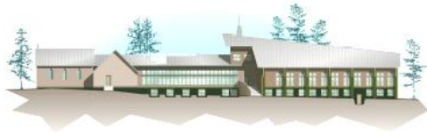
RED DEER LAKE UNITED CHURCH